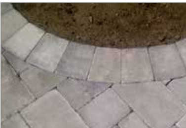
A border with excellent cuts

A great contractor will pay close attention to the details, in paver placement and cutting so that joints are even and aesthetically appealing.