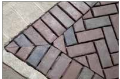
Remarkable attention to detail

REMEMBER - A quality project is built upon a solid foundation. For this reason, we recommend hiring a professional contractor.